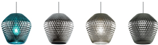
silver/aqua shown on silver/aqua shown off silver/champagne shown on silver/champagne shown off