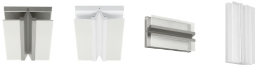
flush mount satin nickel flush mount white nickel wall mount satin nickel wall mount white nickel