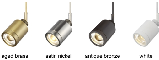
aged brass satin nickel antique bronze white