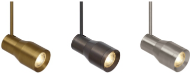
aged brass antique bronze satin nickel