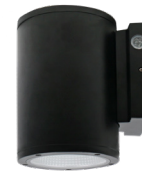
6", 1 LIGHT