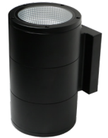
6", 2 LIGHTS