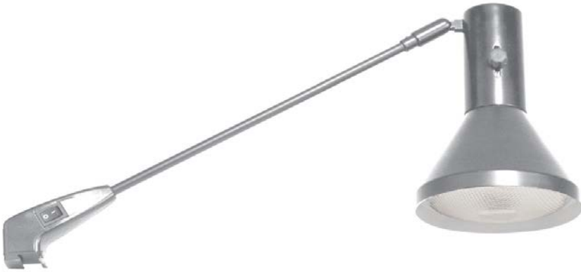
Display Light Silver 150 Watt

Height 18 Width/Length 4 Depth 3 Weight 3